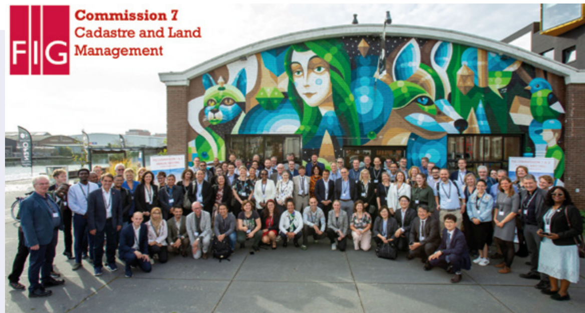
The FIG Commission 7 annual meeting took place from 2-4 October in Deventer, The Netherlands